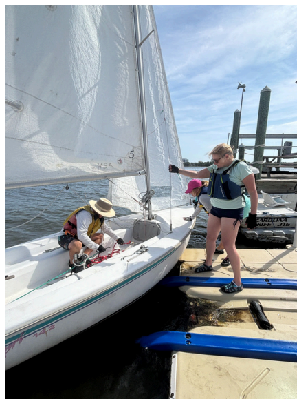
The April 26 Capri Refresher Course.