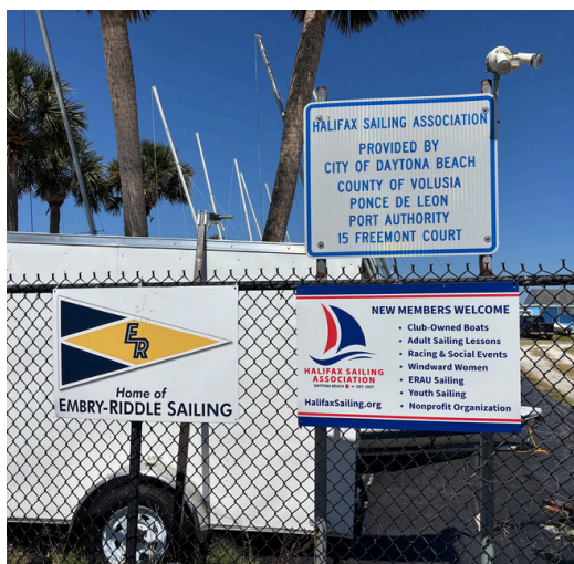
New signage at HSA.